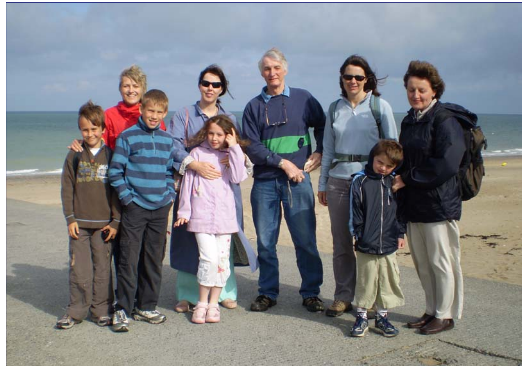
This walk was along a part of the coast near St. Martin de Brehal.