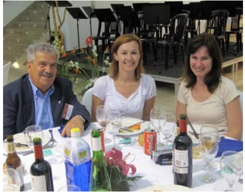
The Zvolen girls with our new friend from Malta

We were offered lots of possibilities of international cooperation. There were many interesting ideas and presentations filled with personal contacts. This unique atmosphere did not cause any barriers or working problems. Although there were varied opinions on many topics, making