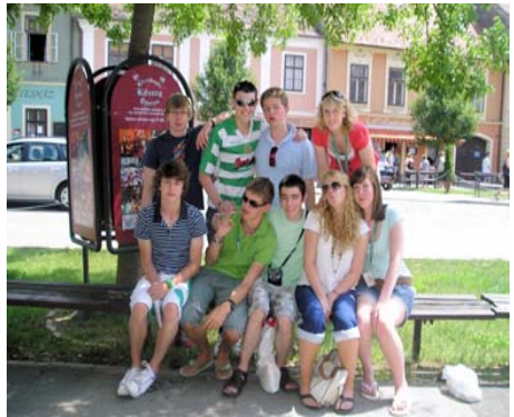
The Sherborne group

The MAMI trip to Koszeg was one of the best weeks of my life. I had such great fun meeting new people and made some brilliant new friends. The work we did was very beneficial in understanding how other people feel and what we can do to help Major Minorities in Britain. The people there were absolutely fantastic and I would definitely go again if the opportunity arose.