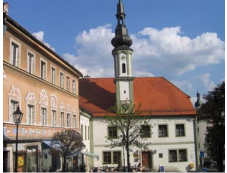
Bad Koetzing – the old Rathaus