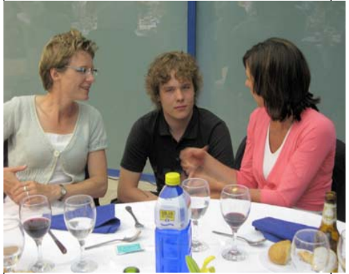
Brainstorming with delegates from Meerssen

Much happens in a year; you can't rush or postpone things and expect them to turn out alright. You could see clearly that lots of different views were involved, evoked by the national